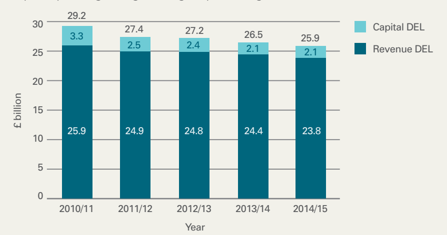
Notes: 1. All figures are at 2010/11 prices.

The Scottish Government's revenue and capital budgets 2010/11 to 2014/15 Public spending will fall significantly over the four years to 2014/15 with capital spending facing the largest percentage reductions.