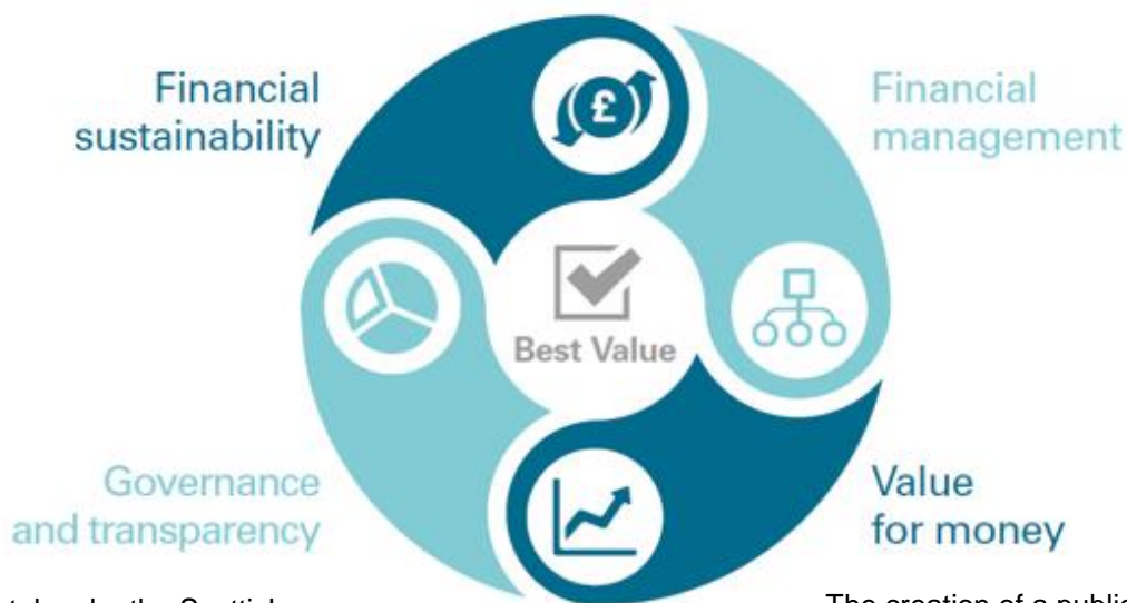
Exhibit 1 Impact in terms of the four audit dimensions

Action taken by the Scottish Government to clarify its expectations of CPPs have helped to improve governance by setting out long-term expectations against which performance can be assessed.