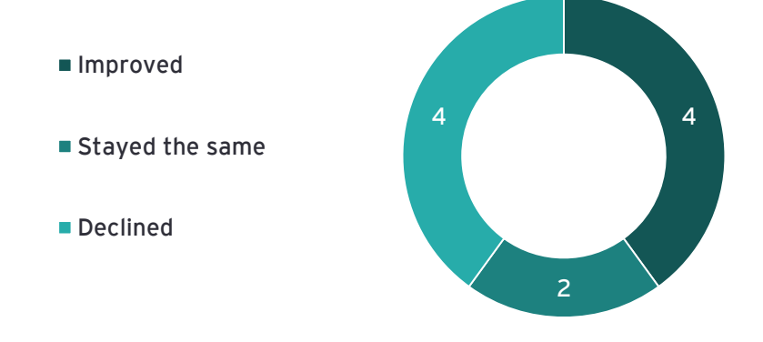
Exhibit 2: College performance has improved for 40% of the key performance indicators in 2019/20

The College's Strategic Plan 2018-23 was published in March 2018 and sought to address key challenges, including areas of poor performance against the rest of the sector in student satisfaction, positive destinations and attainment. Twelve Key Performance Indicators (KPIs) have been adopted to monitor the achievement of the Plan however two indicators are not yet available. The College's financial statements present the most up to date performance against the indicators.