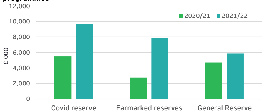
Exhibit 1: The IJBs Reserves continued to rise in 2021/22, although the majority of reserves are earmarked for covid or planned improvement programmes